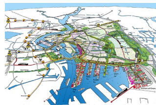
A New Perspective for Rotterdam South, NL