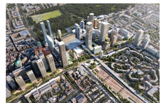
The Hague Central Station Urban Plan Vision NL