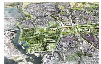
Stadspark XL, Dordrecht, NL