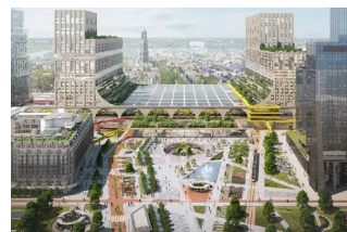
NS Journey of the Future, NL