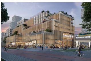
NS Mobility hub, NL