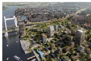
Spoorzone Dordrecht, NL