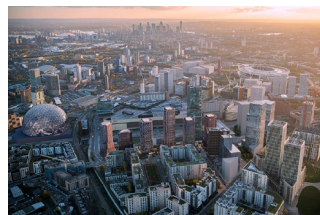
International Quarter London, UK